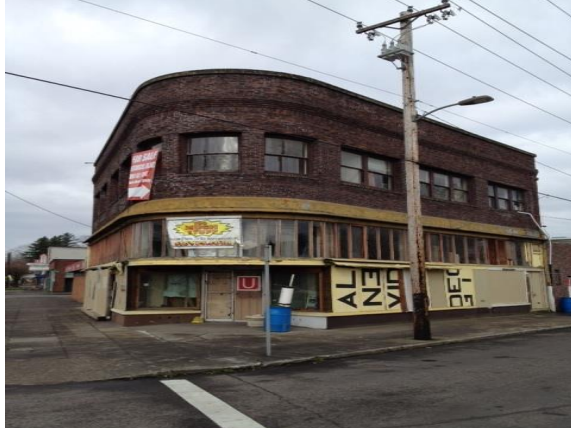
Phoenix Pharmacy in 1934