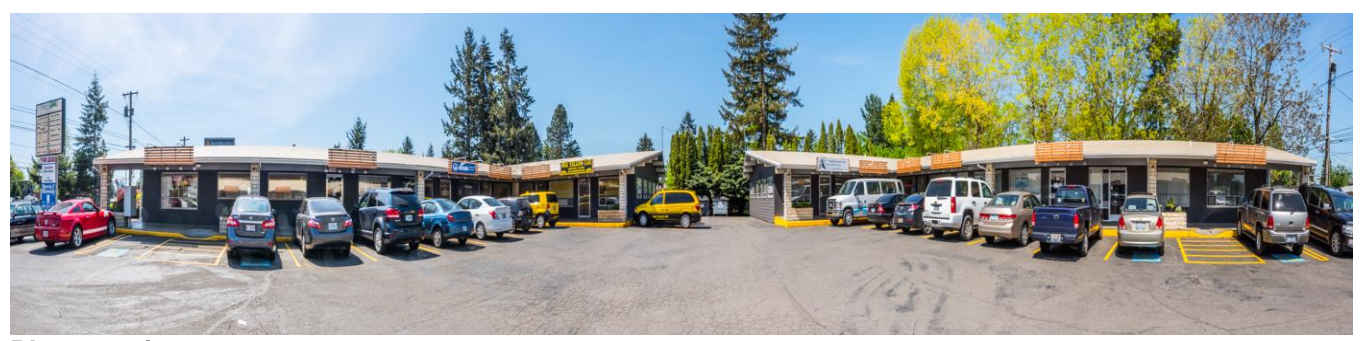
Plaza 122 in 2018

Plaza 122, built in 1962 as a single story (with basement) commercial/retail zoned office space, has 28,672 sg. ft. on a 1.43 acre lot. The property was in foreclosure, leased at only 66%, with deferred maintenance needs defined in an appraisal shared by the listing agency. The scoring of Plaza 122 proved financially feasible with a mid-range score for Category One, Property Value, with a price of $1.2 million and an estimated $200K in repairs and necessary tenant improvement upgrades. Category Two, Government Support, scored low for its potential for government support. Categories Three and Four for Housing and Partners scored high with the property's proximity to many churches, a library, fire station, a large high school, significant affordable housing units (only 35% of the area homes were owner-occupied, 90% of nearby school qualified for freereduced lunch program), significant ethnic diversity and strong neighborhood groups and associations. Categories Five, Six and Seven for Flexibility, Location and Neighborhood, which focused on property characteristics and location, scored high because of visibility, proximity to high traffic areas, multi-use possibilities and the possibility of diverse tenant use given a wide range of office sizes. Category Eight for Intangibles scored high for the curb appeal of the building as a mid-century modern building. Plaza 122 scored 34 out of a possible 40 points, with the lowest category being the potential for government support.